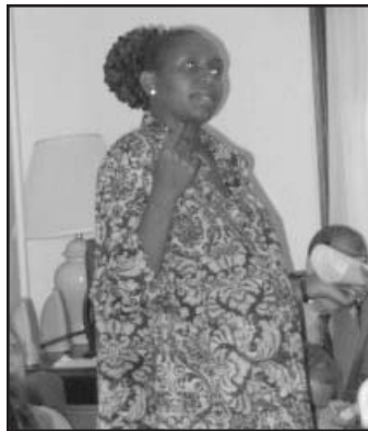
A guest of the Inn Between shares her views at the Legislative Breakfast

else, but not how to take care of me. My daughter is an inspira-