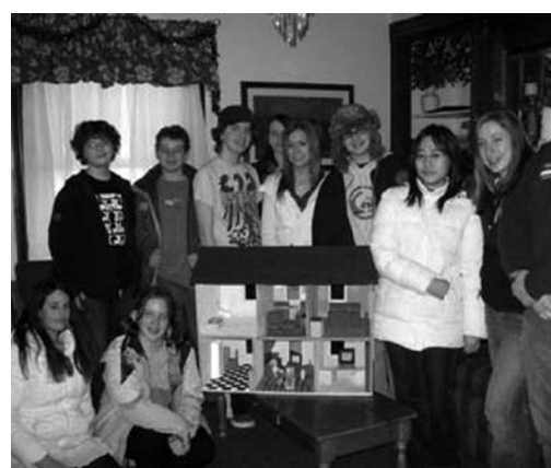
Standing proudly behind one of the two dollhouses they designed and built are high school students of Sparhawk School in Salisbury, MA.

Santa flew in from the North Pole, and the wide-eyed expression from the party-goers at Santa’s presence was worth its weight in gold! The evening included wonderful food offerings